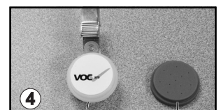
Cap Green secondary diffusion barrier