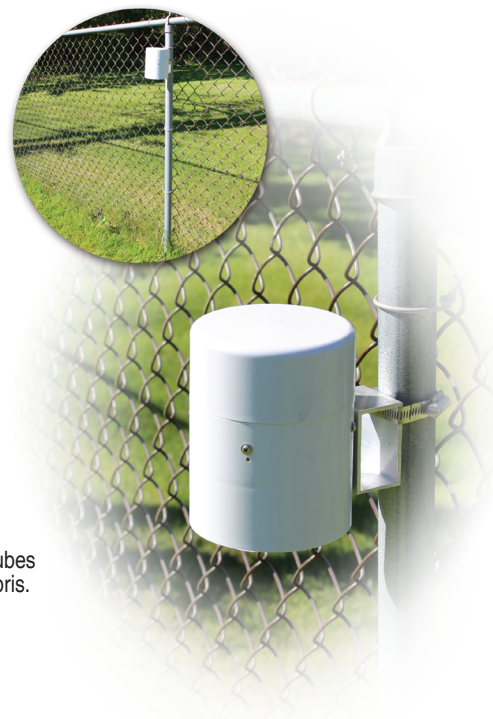
Shelter protects tubes from rain and debris.