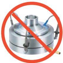
Single-stage impactor with spring clamps