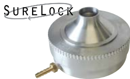
Single-stage BioStage with SureLock seal

► SureLock positive seal ensures sample integrity