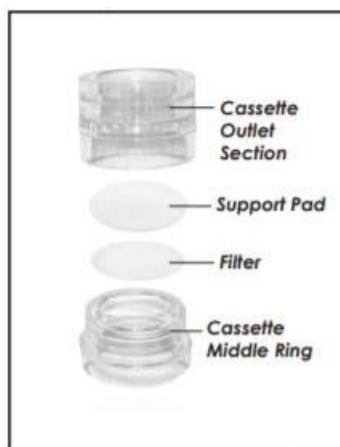
Figure 1. Assemble filter cassette for installation on cyclone

The filter cassette holds the filter securely in place during sampling. The cassette consists of an inlet section, an outlet section, and possibly a middle ring or extension cowl. The cassette is used with the inlet section removed for mounting on the cyclone.