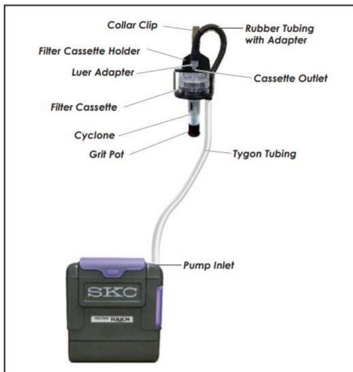
Figure 3. Sampling train with filter cassette and Aluminum Cyclone in Filter Cassette Holder

When ready to start sampling, prepare a new filter cassette identical to the one used for calibrating the flow. Mount the cassette on the cyclone as directed in Step 1. Insert the loaded cassette/cyclone assembly into a filter cassette holder with the cyclone stem facing down. Secure the cassette with the spring-loaded hold-down plate and insert the adapter on the end of the short piece of spring reinforced rubber tubing into the cassette outlet. Connect the long piece of Tygon tubing to the pump inlet. Clip the filter holder to a worker's collar in the breathing zone and the pump to the worker's belt. The cyclone stem should be in a vertical position facing down. Turn on the pump. Note the start time and any other pertinent sampling information.