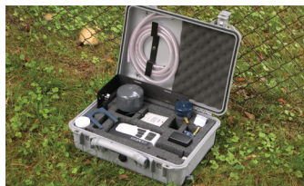
Combine with IMPACT Samplers in SKC Deployable Sampler Systems