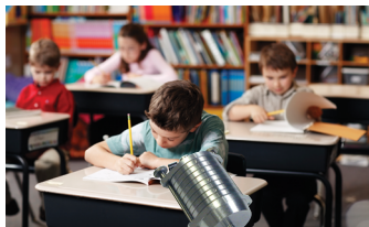
Partner with Sioutas Impactor for childhood asthma studies