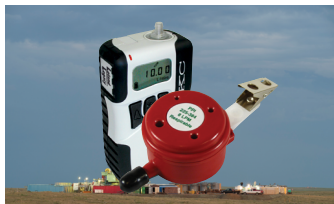
Use with 8 L/min PPI Sampler for short-term respirable dust/silica sampling