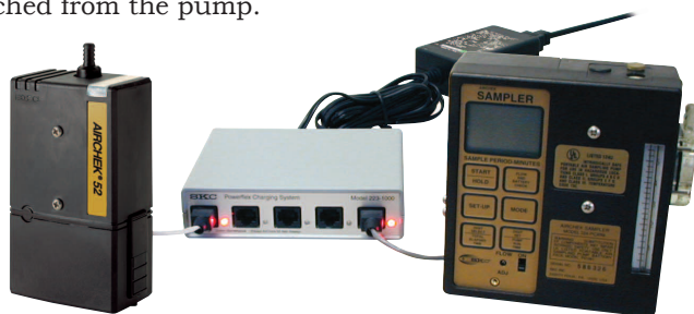
Five-station PowerFlex charging the AirChek 52 and Universal PCXR8

Pump-specific cables are used to connect battery packs to the PowerFlex. Simply plug the appropriate cable into a PowerFlex port and plug the other end into the appropriate pump charging jack. An LED indicates charge mode. PowerFlex charges most battery packs within six hours and automatically switches to a safe pulse trickle charge when full charge is detected. Each attached battery pack runs through an independent charge cycle. Battery packs can be charged either attached to or detached from the pump.