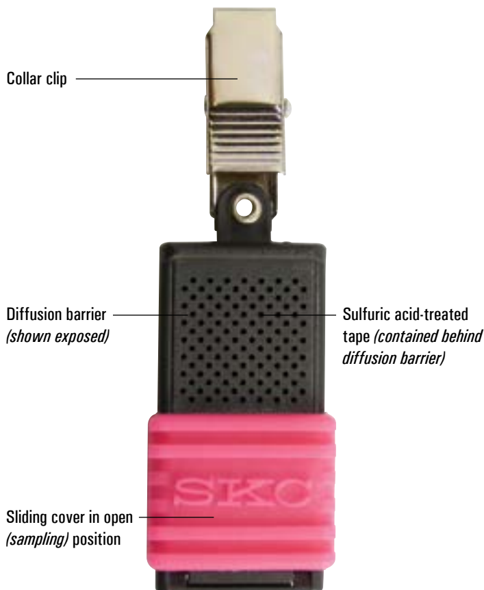
UMEX ® 300 Sampler with sliding cover in sampling position