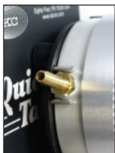
Close-up of outlet between guide pins